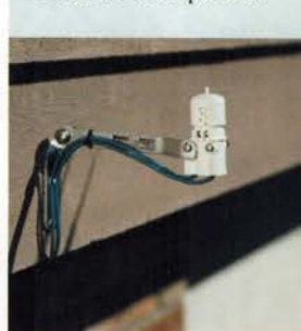
Works with Weather Sensors